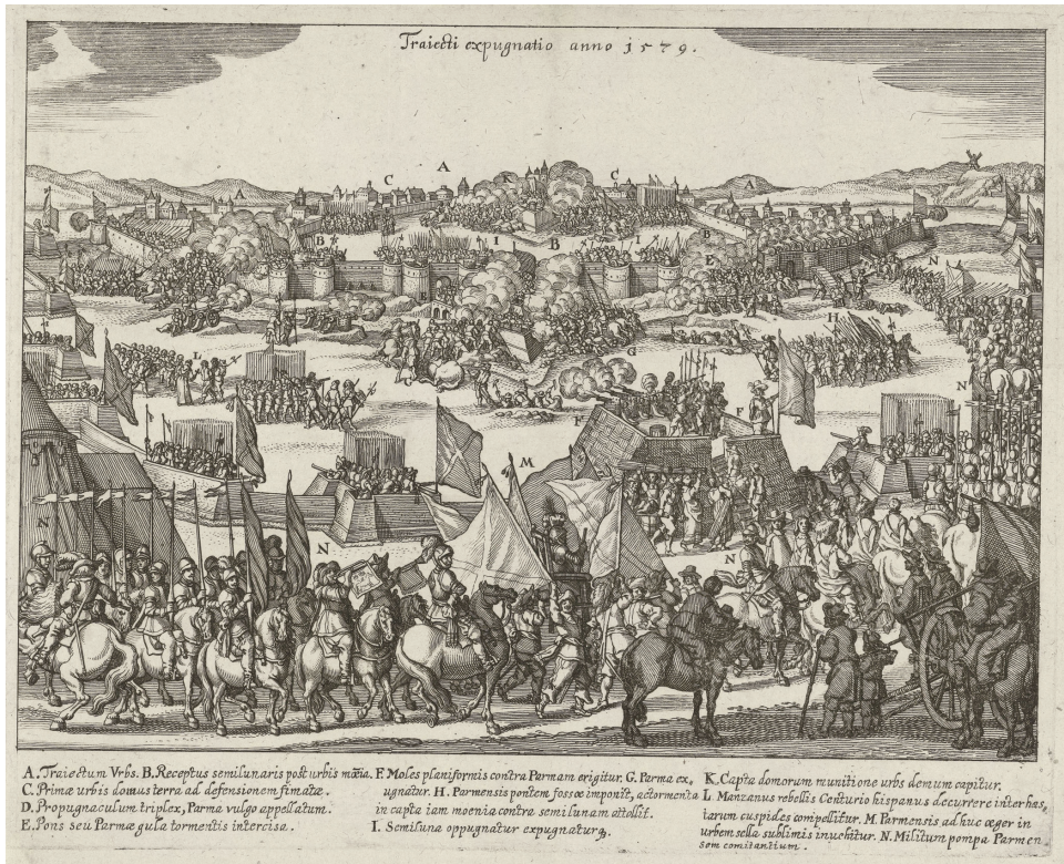
Fig. 4 Anonymous, after Hogenberg and copied from Jan Miel, The Capture of Maastricht in 1579, etching, 22 x 27,2 cm, in: F. Strada, De Bello belgico decades, Mainz 1651, inserted after p. 434, Amsterdam, Rijksmuseum.

it is evident that it is all based on the latest scholarship, but the touch is light, and the book is extremely readable.