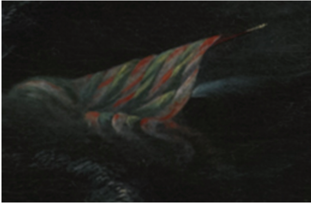
Fig. 6 Detail from Van Wieringen's Gibraltar , Amsterdam, Het Scheepvaartmuseum A.0724.