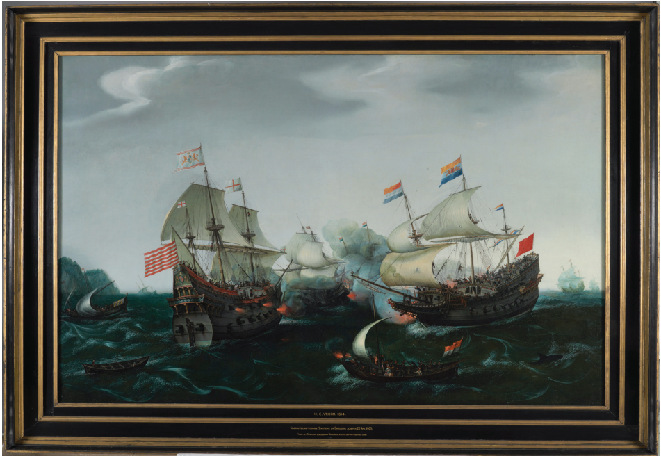
Fig. 1 Hendrick Cornelisz. Vroom, Skirmish between Amsterdam and English ships, 20 April 1605 (1614) , oil on canvas, 151,5 × 238 cm, Amsterdam, Het Scheepvaartmuseum, A.0002.

battles. 6 Arguably this subgenre reached its zenith during the third quarter of the seventeenth century during the Anglo-Dutch Wars, with Willem van de Velde the Elder (1611-1693) and his son, Willem the Younger (1633-1707), leading the pack of marine artists. The former was also commissioned by the admiralty to sketch images of naval battles and even travelled with the fleet to witness live clashes. 7