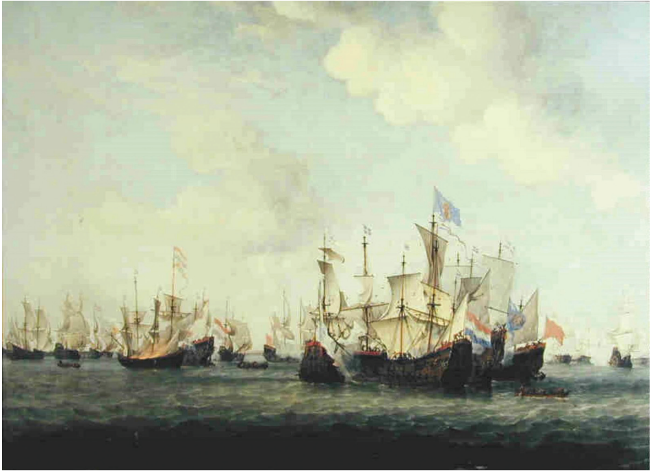
Fig. 14 Willem van de Velde II, Battle between Holland and French commercial ships (1672), oil on canvas, 85 × 107,5 cm, Amsterdam, Het Scheepvaartmuseum, Amsterdam, B.0207(04).

Dutch Republic (fig. 14). 89 In the Skirmish between Dutch and Turkish ships (1650) by Jeronymus van Diest, the Dutch flag is clearly higher, consistent with the notion that the Ottoman Empire was outside the European system. 90