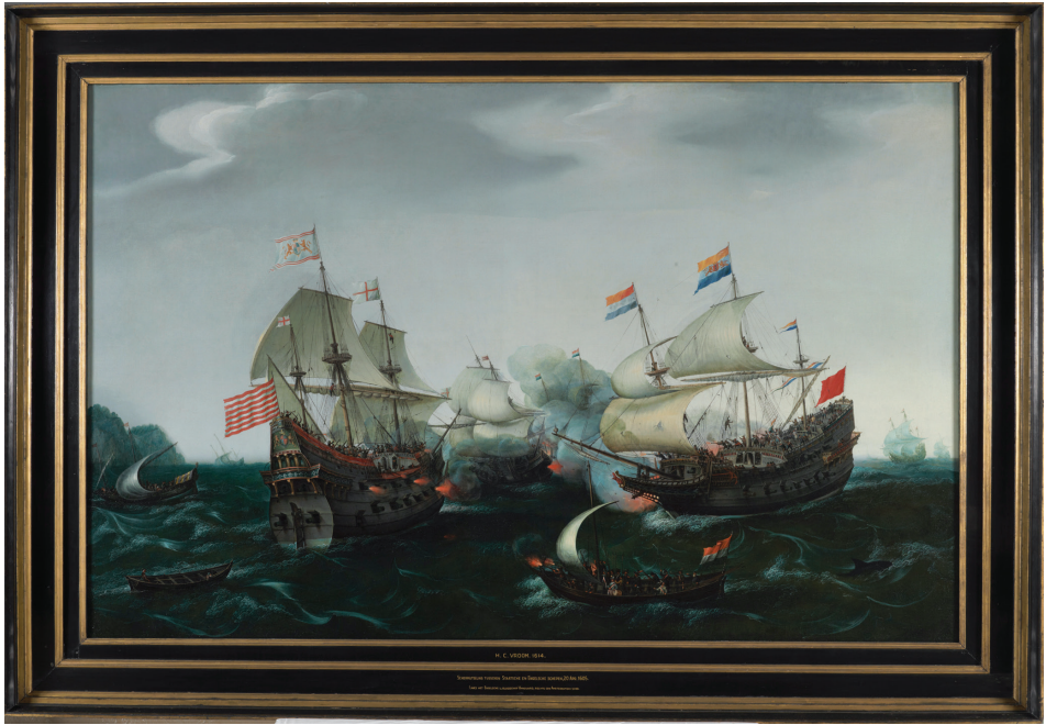
Fig. 12 Vroom, Skirmish, Amsterdam, Het Scheepvaartmuseum A.0002.

Whereas the motif of the humiliated flag is obvious in a range of paintings, there is yet another way in which international hierarchy is negotiated, namely through the positioning of flags. If we look again at Vroom's painting of the encounter between an English and a Dutch ship, it might be interpreted as a Dutch challenge to the English claim to dominion (fig. 12). 86 Yet I believe the message is more complex: it is striking that in the painting, the Stuart flag is depicted slightly higher than the Dutch flag. This suggests the Dutch acknowledged their inferior position to the English crown, even if they challenged the English claim to dominion as such.