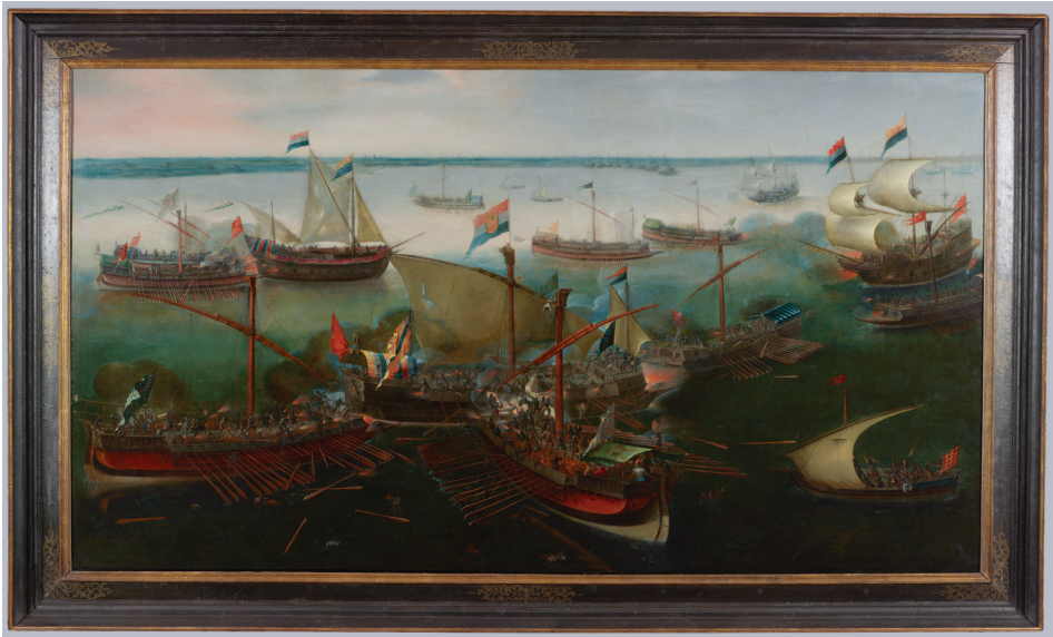
Fig. 8 Ascribed to: Hendrick Cornelisz. Vroom, The Battle of Sluis between Holland and Spanish galleys, 26 May 1603 (ca. 1603), oil on canvas, 132,5 × 240 cm, Amsterdam, Het Scheepvaartmuseum , 1990.0746.