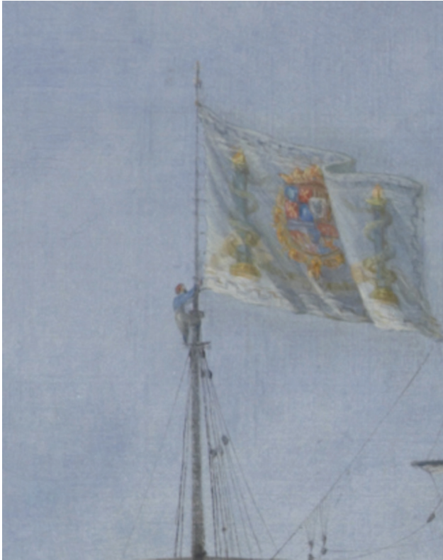
Fig. 4 Detail from Van Wieringen's Battle of Gibraltar , Amsterdam, Het Scheepvaartmuseum, A.0724.

sinking of one of those particular ships was therefore a punishment from God. 43 Another one, on the Battle of Gibraltar of 1607, satirises the defeated Spanish who had to fly the white flag and 'sing their misericords'. 44 A similar poem on Gibraltar satirises the 'torn cross' in the banner of a Spanish flag, whereas another hails the 'battle for the true faith'. The same poem praises the act of tearing down the 'torn cross'. 45 In historical context, it seems plausible to suggest that the discrediting of Catholic images echoes the Iconoclastic Fury of 1566, when Dutch Calvinists removed or destroyed statues and images of saints from Catholic churches.