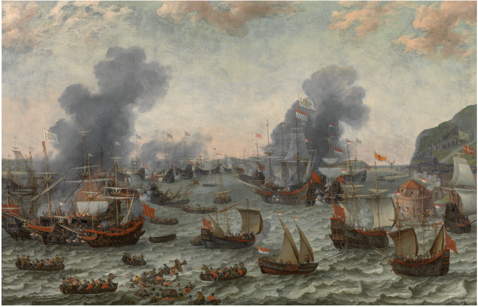
Fig. 13 Adam Willaerts, La Batalla de Gibraltar, 25 de abril 1607 (ca. 1617) , oil on canvas, 78,3 cm × 121,5 cm, Madrid, Museo del Prado, Po7758.

smaller Burgundian cross on the far left, used in the fifteenth and early sixteenth centuries by the Habsburgs, is uppermost. Moreover, the exact same arrangement can be observed in a painting by Adam Willaerts of the Battle of Gibraltar (1607). The fleet is depicted in the distance, but a closer look reveals that the highest flag depicted is the Spanish flag with the royal standard, flanked by the two pillars of Hercules. 87 Likewise, another piece by Willaerts of Gibraltar prominently shows the Spanish royal standard in the very centre of the painting and on top (fig. 13). 88 The same can be said for the painting discussed above, in which the flagship the Royal James was portrayed in a humiliating posture: the English flag, though tarnished or blackened, is still uppermost, consistent with English precedence in international relations.