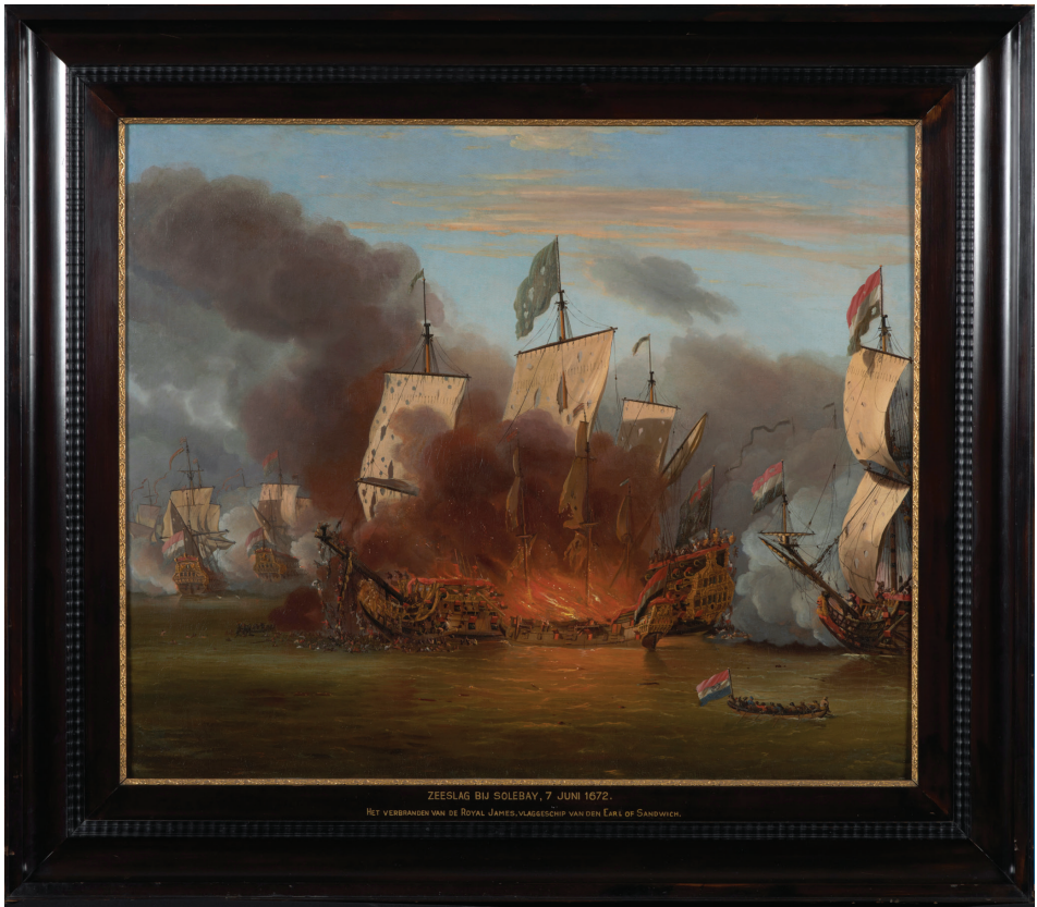
Fig. 10 Willem van de Velde II, Battle of Solebay, 7 June 1672 (c. 1675), oil on canvas, 77 × 91,5 cm, Amsterdam, Het Scheepvaartmuseum, A.0004.

the 1672 Battle of Solebay during the Third Anglo-Dutch War (fig. 10). 80 A Dutch fireship successfully attacked and sank the flagship the Royal James , commanded by the Earl of Sandwich. The painting depicts the moment that the ship has caught fire. Prominent in the painting is the flag on the main mast of the Royal James , blackened from smoke or fire, and with visible burn-holes. It would have been the royal standard, so the tarnished flag was a denigration of the king's person. 81 This is a significant detail, for the English declaration of war of 1672 specifically stated that Dutch insult to the King of England was a casus belli . 82