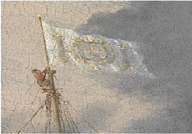
Fig. 5 Detail from Adam Willaerts, La Batalla de Gibraltar , 25 de abril 1607 (ca. 1617), oil on canvas, 78,3 cm × 121,5, Madrid, Museo del Prado, P07758.

symbol of the Order of the Golden Fleece. 46 The scene of the sailor capturing the royal flag as depicted by Van Wieringen is represented in exactly the same way in Adam Willaert's piece on Gibraltar, now in the Prado Museum in Madrid (fig. 5). The detail is significant because that particular flag may very well be the most central feature of the whole painting. From contemporary sources we know that the Dutch admiral Van Heemskerck promised fifty pieces of eight to the first man one who captured the enemy admiral's flag. This was a customary incentive. The States-General awarded generous prizes for capturing an enemy flag, depending on size and rank. 47