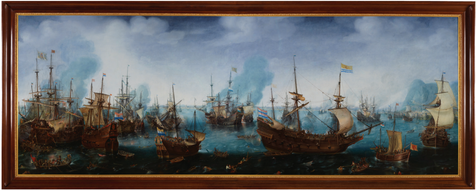
Fig. 2 Cornelis Claesz. van Wieringen, Battle of Gibraltar, 25 April 1607 (1622), oil on canvas, 180 × 488 cm, Amsterdam, Het Scheepvaartmuseum, A.0724.