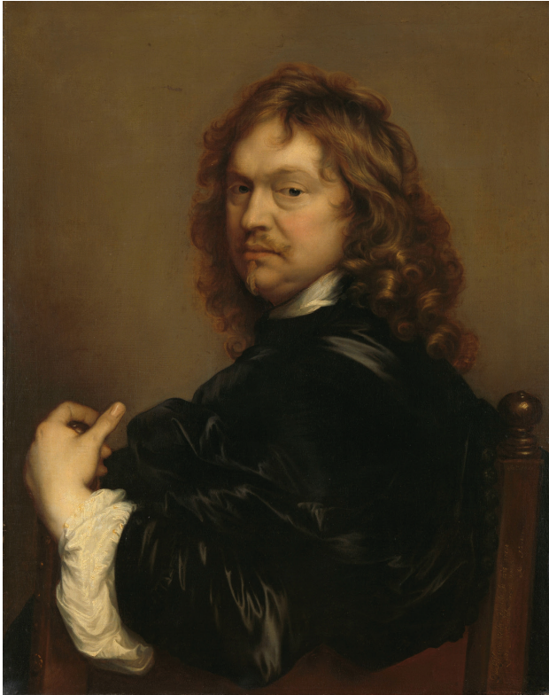
Fig. 2 Adriaan Hanneman, Self Portrait, 1656, oil on canvas, 81,5 × 64 cm, Amsterdam, Rijksmuseum.

The most important indication that social differentiation played a role in the separation of the artist painters of The Hague is the word grootsmoedicheyt , used by the kamerschilders in the guild's minutes to describe the motives of the artist painters. 45 But while the word can be understood positively and negatively, it does not appear to have meant 'magnanimity', based on the context. More applicable is the meaning 'pride' or 'haughtiness', both of which could express a sense of superiority and a perceived higher status of their craft. 46 However, we must proceed with caution when speaking of 'the' artist painters; when we consider the group to be homogeneous, we overlook the important fact that not all artist painters supported the decision to leave the guild. In the aforementioned minutes, the kamerschilders specifically mention 'some painters' (' eenige schilders ') who wanted to abandon the St Luke's guild, while the kamerschilders asked the city council to be allowed to continue with not just the glass makers, book sellers, and goldbeaters, but