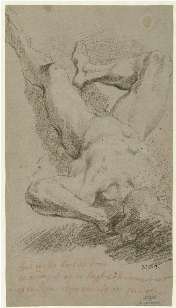
Fig. 4 Willem Doudijns, A Male Nude, 1680, drawing, chalk on paper, 50,5×28 cm, Amsterdam, Rijksmuseum.

the crisis: portrait painters and the painters of high-end easel paintings, such as Caspar Netscher and Godfried Schalcken, who profited more from a society of like-minded men than a traditional guild.