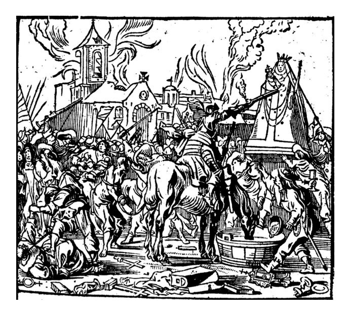
Fig. 2 Depiction of the capture of Tienen: Den Hollantschen iavv en de Fransche kravvvey, 1635, London, The British Library.

She compared her own performance to the earlier governors general and concluded that through her attempts to remain in the population's favour, she had prevented history from repeating itself.