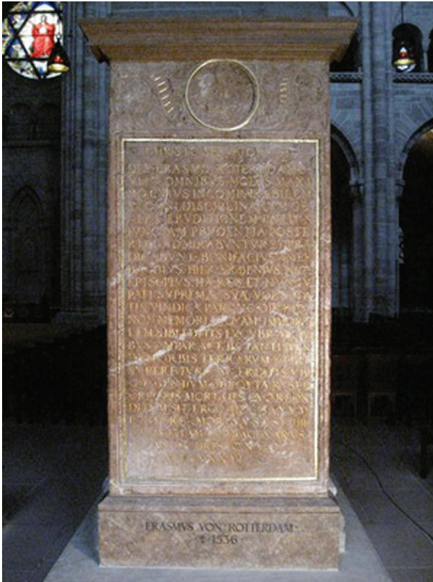
Fig. 1 Memorial monument to Erasmus in the Munster Cathedral in Basel, where Erasmus was buried in 1536.

of which he paid alms to the poor and granted students scholarships. The latter task made him into an extremely well sought-after man, who dispensed numerous scholarships to Protestants and Catholics alike. 53 What exactly Trommius saw remains unclear: he may have mistaken Amerbach's library for Erasmus's; maybe he misunderstood or misremembered the German explanation of the two women.