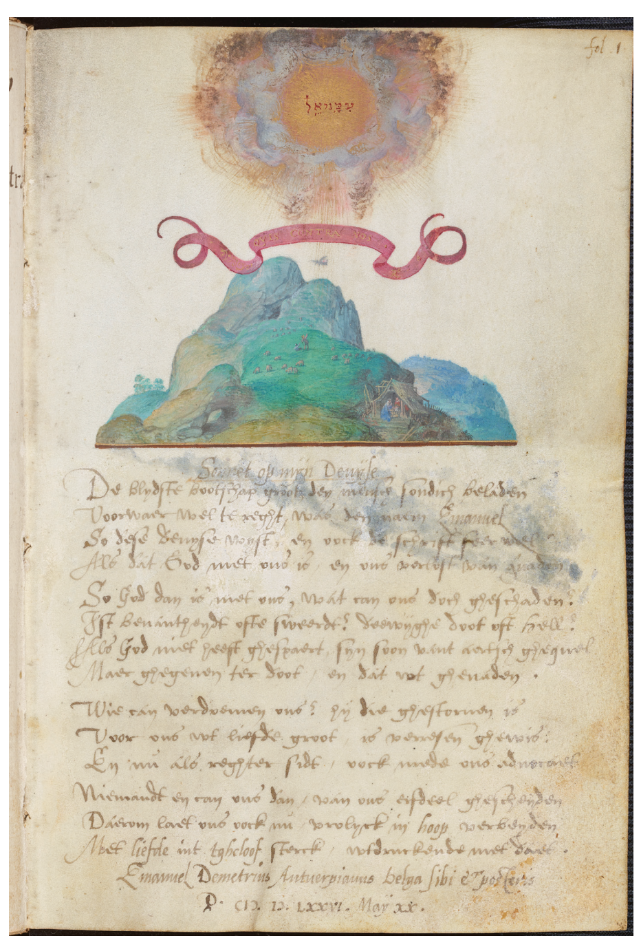
Fig. 1 Emmanuel van Meteren, Sonnet and drawing of the Nativity, in the album amicorum of Emmanuel van Meteren, pen and ink on paper, 13,6 x 19,1 cm, Bodleian Library, Oxford.