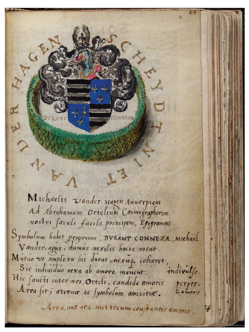
Fig. 2 Michiel van der Haeghen, Coat of arms, pen and ink on paper, 11 x 16 cm, in the album amicorum of Abraham Ortelius, Cambridge, Pembroke College Library.