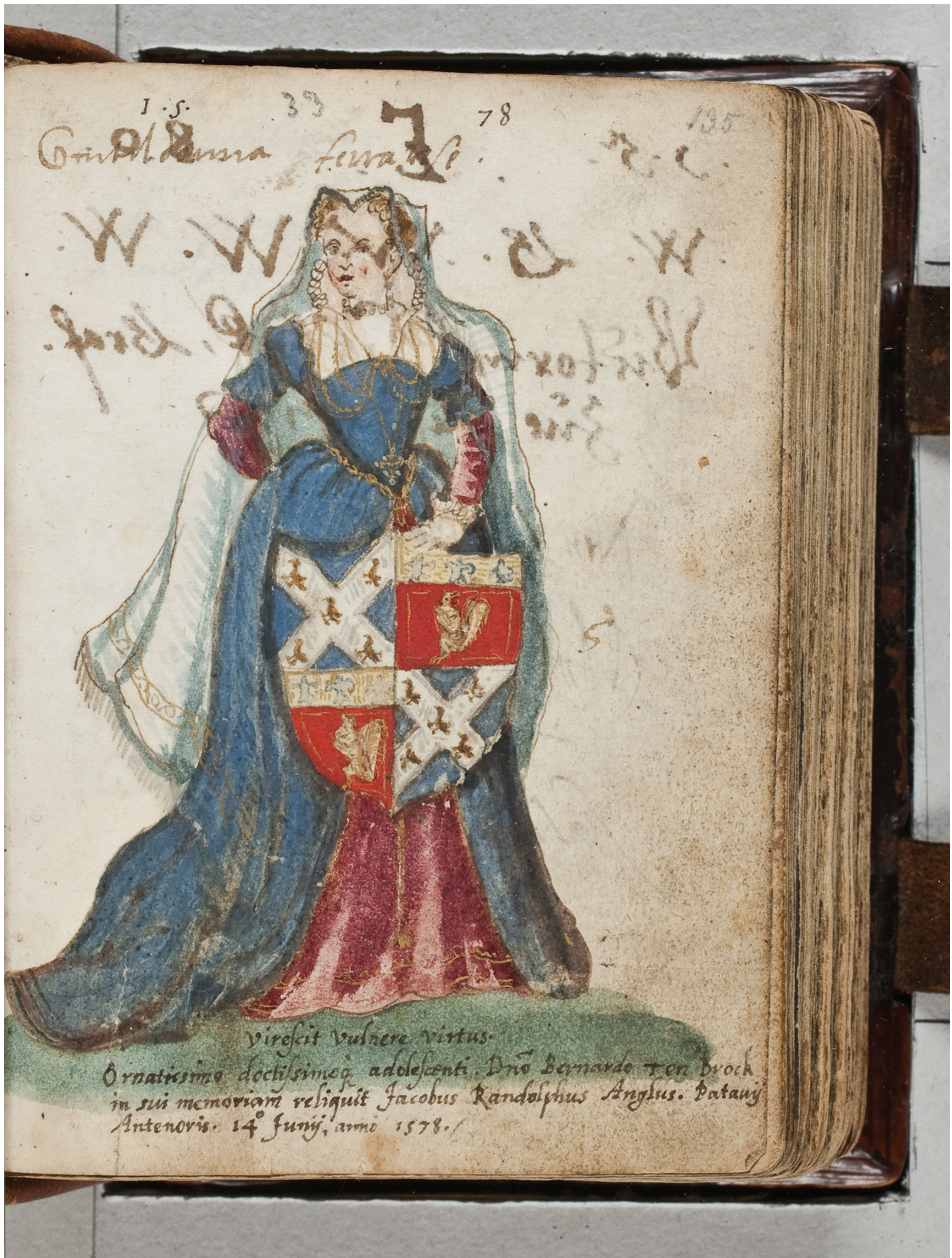
Fig. 4 Contribution by James Randolph, with image caption by Paludanus, in the album amicorum of Bernardus Paludanus, 14 June 1578, pen and gouache on paper, The Hague, Koninklijke Bibliotheek.