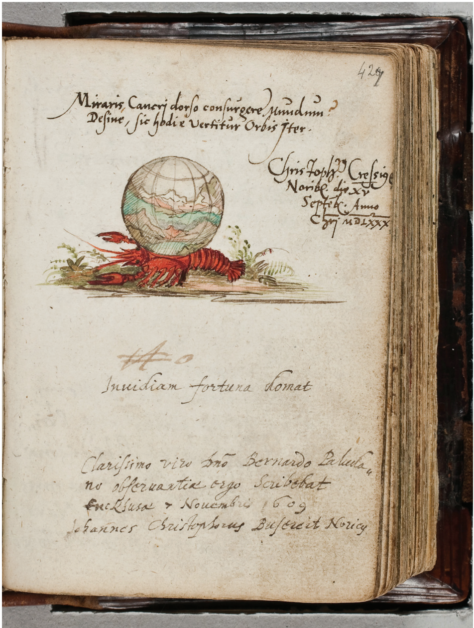
Fig. 3 Contribution by Christophorus Cessius in the album amicorum of Bernardus Paludanus, 25 September 1580, pen and gouache on paper, The Hague, Koninklijke Bibliotheek.